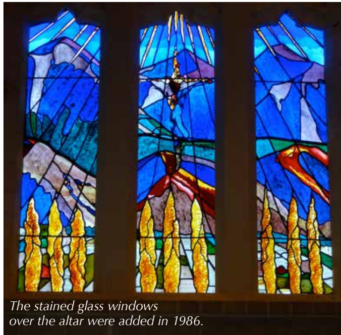
The stained glass windows over the altar were added in 1986.